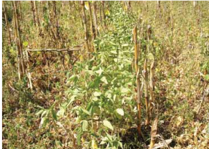
Conservation agriculture promotes permanent soil cover to protect and conserve soil structure. Animal drawn planter (below, right).

crop residue and related organic material on the farm. There are certain compelling factors that have made some farmers adopt conservation agriculture. These include: