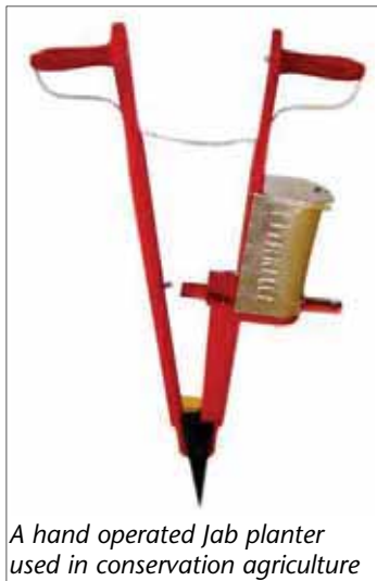
A hand operated Jab planter used in conservation agriculture

Although only about 2 per cent of small-scale farmers practise Conservation Agriculture worldwide, it is considered a useful method that increases farm productivity, and reuses