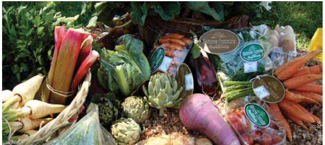
Organic production has not kept pace with the big demand for organic products.

Small-scale farmers groups that would like to sell their produce should know that it is not possible for farmers to market their organic produce