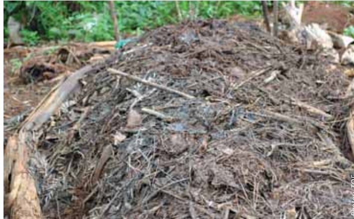
If made the right way, compost can meet all your fertilizer needs

2. Select a place that is sheltered from the wind, rain and sunlight. It is always advisable to make several small heaps if you have a lot of compost material instead of one large heap, which takes a lot of time for compost to be ready. A one metre high pit is ideal. But it is not always necessary to dig a pit because