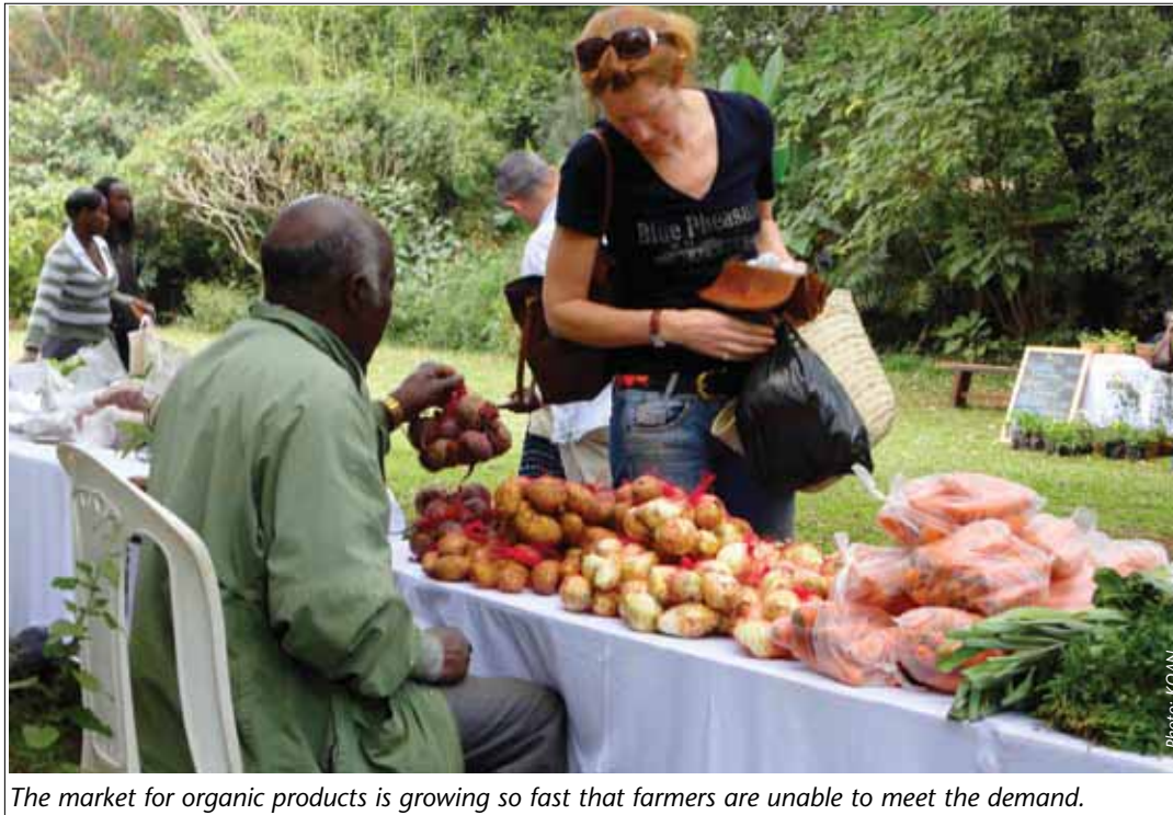
The market for organic products is growing so fast that farmers are unable to meet the demand.