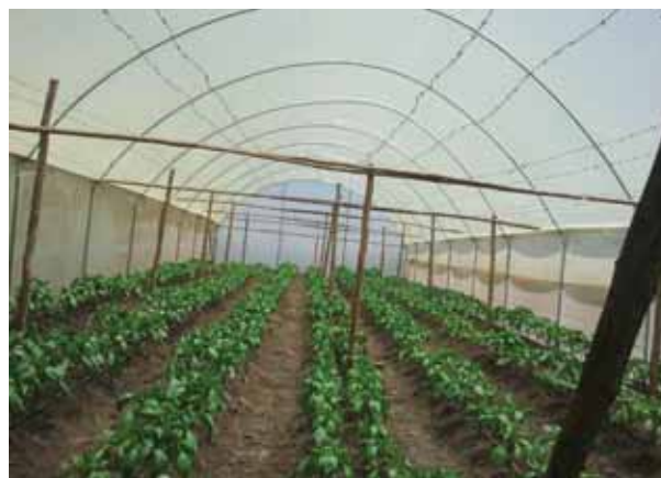
Capsicums in a greenhouse

Greenhouses environment has many negative and dangerous consequences for people working in them especially in conventional farming where chemical application is normal. Most of the chemicals have a lot of side effects on human health. Workers, especially in flower farms, develop serious complications as a result of the chemicals used to control pests and diseases. All companies or farmers are required to provide protective clothing to greenhouse workers. Poor use of such equipment has, however, led